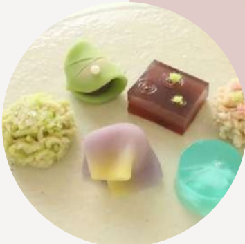
Japanese sweet "Wagashi"